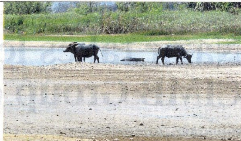
Buffaloes cooling off in the mud at Timah Tasoh Dam in Padang Besar, Perlis, yesterday.

Muda is among three dams managed by Mada, with the others being Ahning and Pedu. Beris Dam, on the other hand, is managed by the Irrigation and Drainage Department (DID).