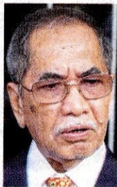
Datuk Seri Dr Wan Junaidi Tuanku Jaafar

The meeting will include representatives from the Science, Technology and Innovation Ministry, Education Ministry, Meteorological Department, Wildlife and National Parks Department and other agencies.