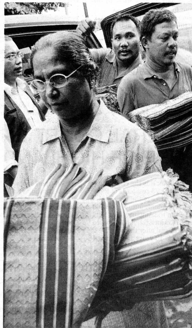
WARM RELIEF: Welfare personnel distributing blankets to affected residents

The stretch of Jalan Beringin near Jalan Setiakasih 5 in Bukit Damansara was also flooded, and this forced motorists to use alternative roads to reach their destinations in the city.