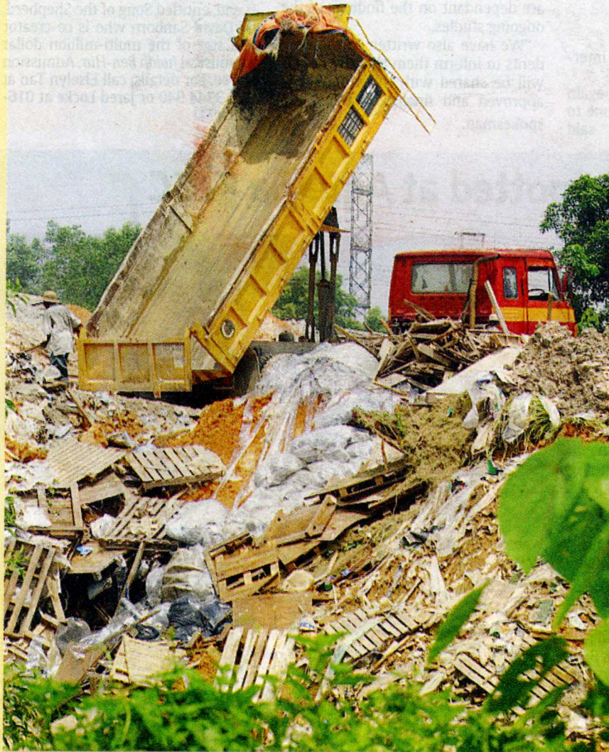
They have found a convenient place to dump waste even if it means at the people's expense.

"If the dump is illegal, we'll close it down," he said.