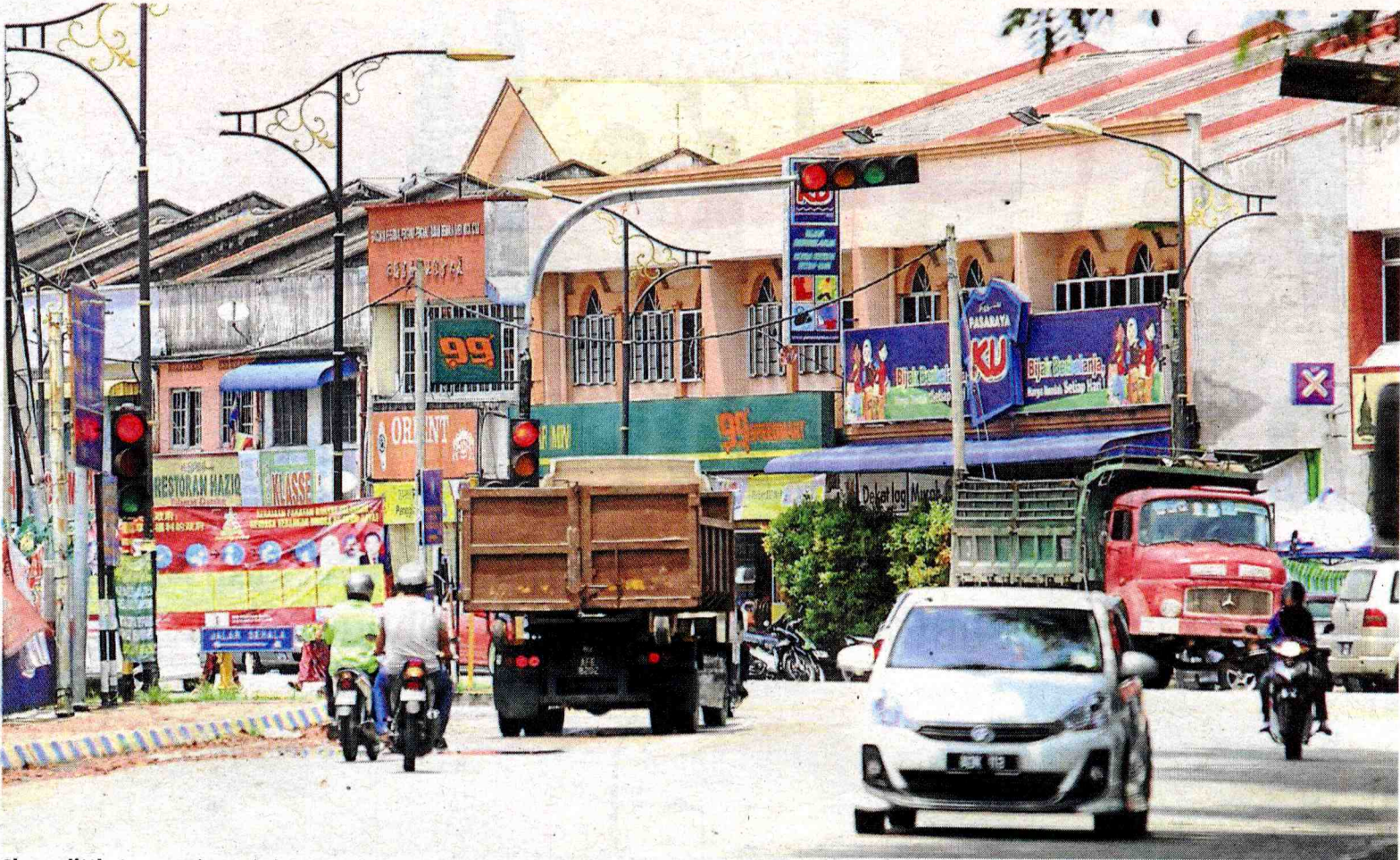
Sleepy little town: Pekan Sabak Bernam is the town centre for Sabak Bernam, Selangor.

Political parties will have to prove they can help the planters, farmers and fishermen of Sabak Bernam to harvest the most votes for GE13.