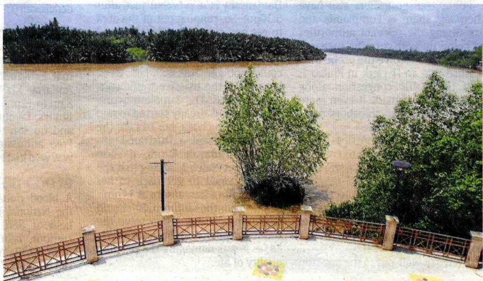
Source of livelihood: A large percentage of the constituency uses Sungai Bernam as their primary source of income.