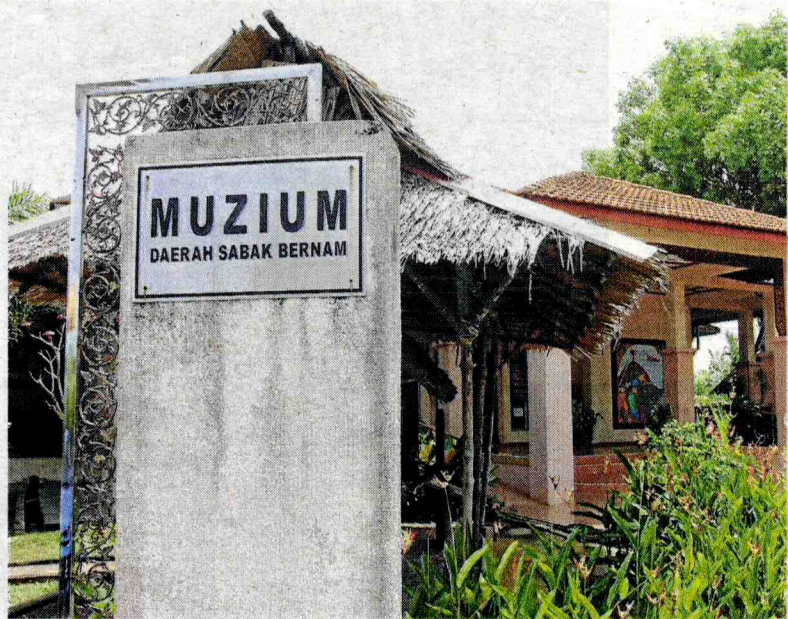
Agricultural history: The Sabak Bernam District Museum is the keeper of agricultural and fishery history as well as traditional fishing equipment.