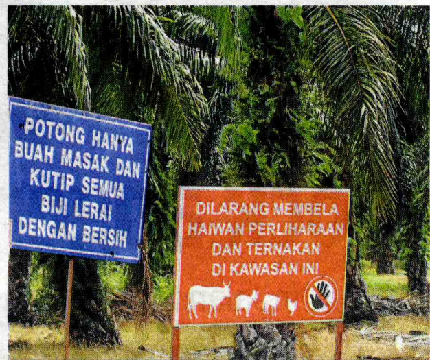
Vital crop: An oil palm plantation in Sabak Bernam. Planters say they want the oil palm free fruit prices controlled.

"It's time we have a hospital with specialist doctors," he said.