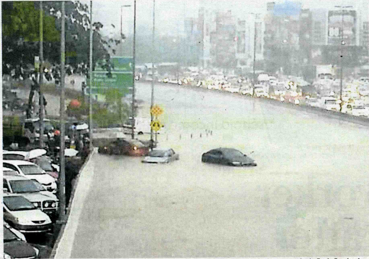
Three vehicles are trapped by flood waters, which was as high as 1.5m, during yesterday's flash floods along Km21 and Km24 of the Damansara-Puchong Expressway.

"I was very lucky that my car did not break down," she said, adding that at least four to five cars had broken down along the highway following the floods.