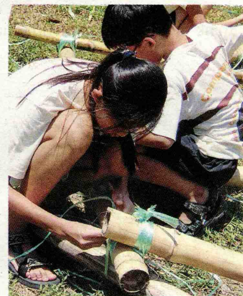
Challenge to build own raft