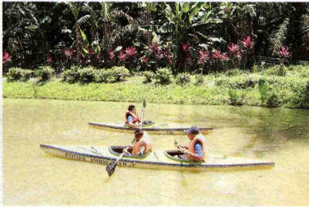
Enjoying themselves kayaking