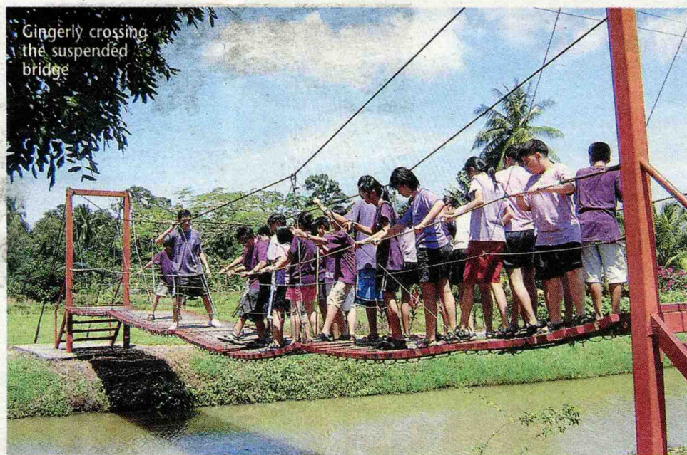
Gingerly crossing the suspended bridge

Since 2002, the Recreational Park has hosted visitors at its 12-acre site adjacent to the Sg Sudah Agriculture Department office situated along the 52km mark of the Muar-Batu Pahat main road. For your own enriching outdoor experience in the Recreational Park, contact the Tour Coordinator on 019-7833382.