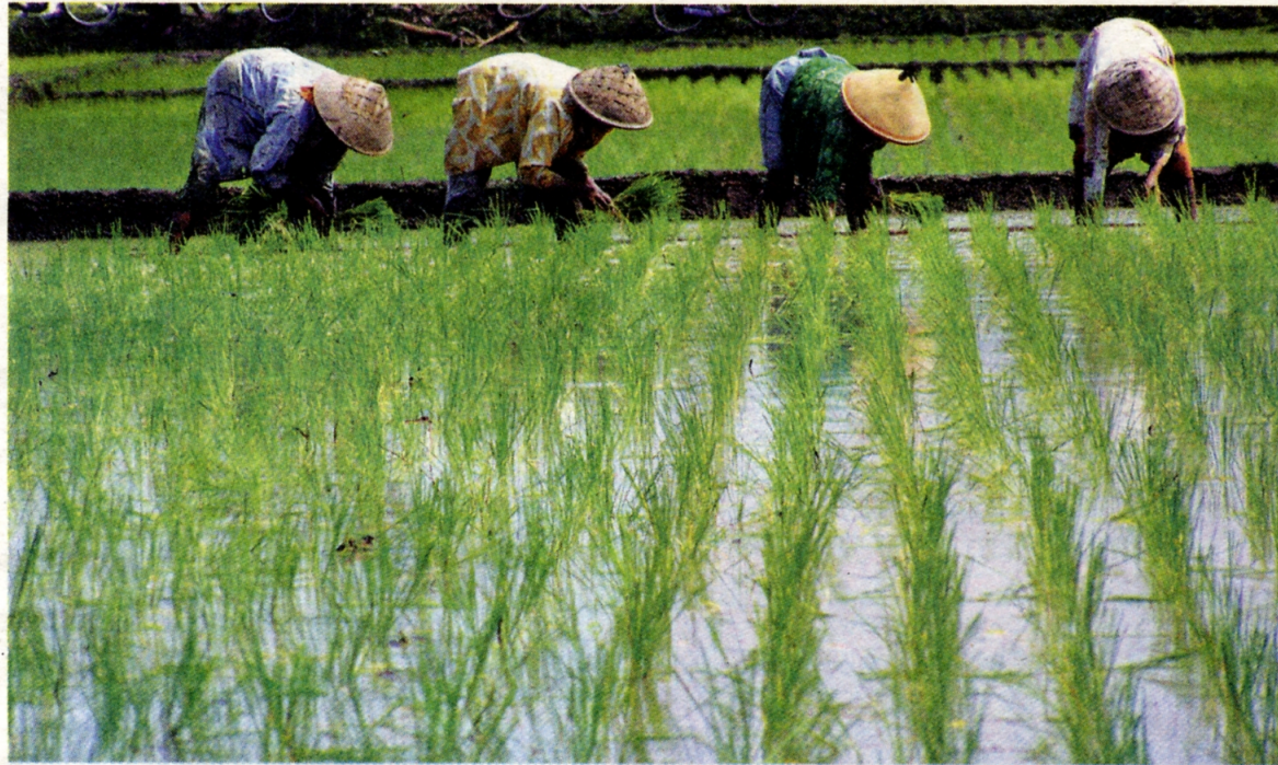
A lot of water is needed in padi cultivation.