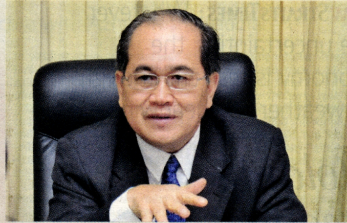
Datuk Seri Douglas Uggah Embas