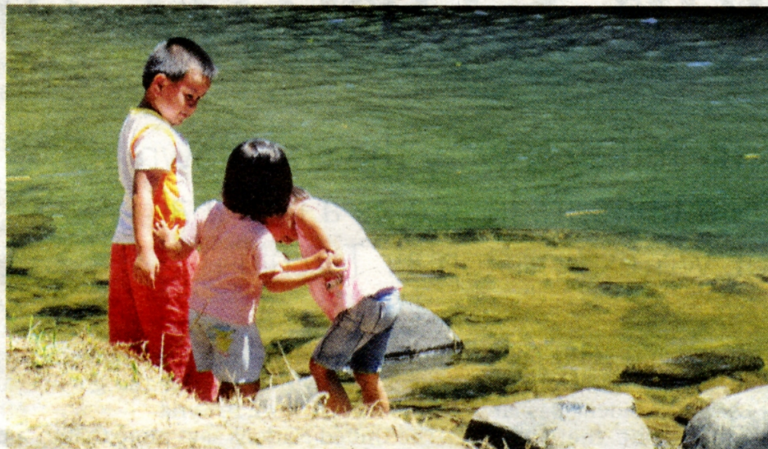
There is a need to protect and preserve water resources for the well-being of future generations.

They will learn, for example, about how much water is needed to produce certain food or the type of food which