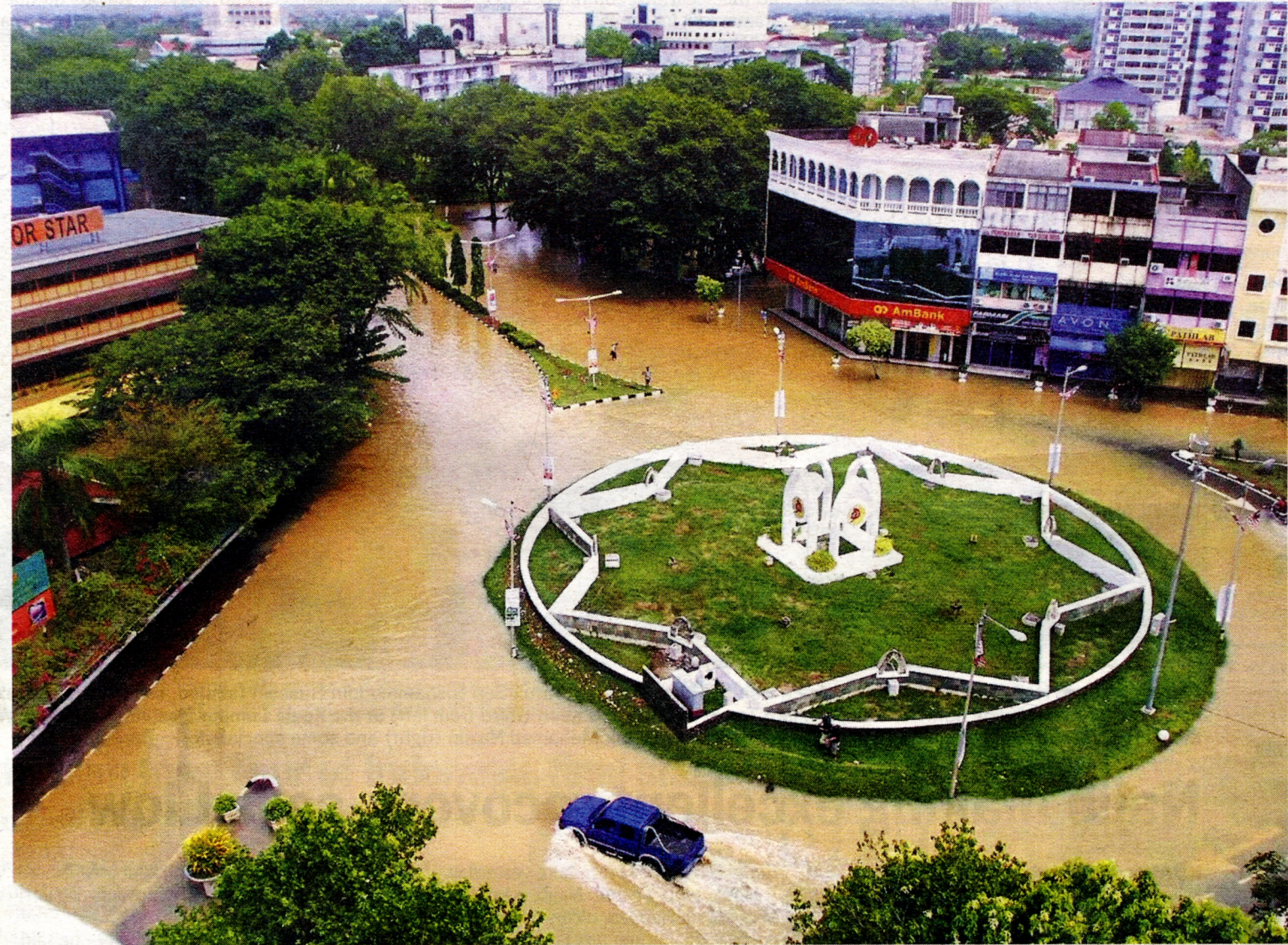
River city: An aerial view of Alor Setar in front of Bulatan Maal Hijrah yesterday. Although the flood situation in most parts of Kedah has improved, it is not the same in the city with many roads still closed. The Sultan Abdul Halim Airport also remains closed. Reports on Pages 6 and 7.