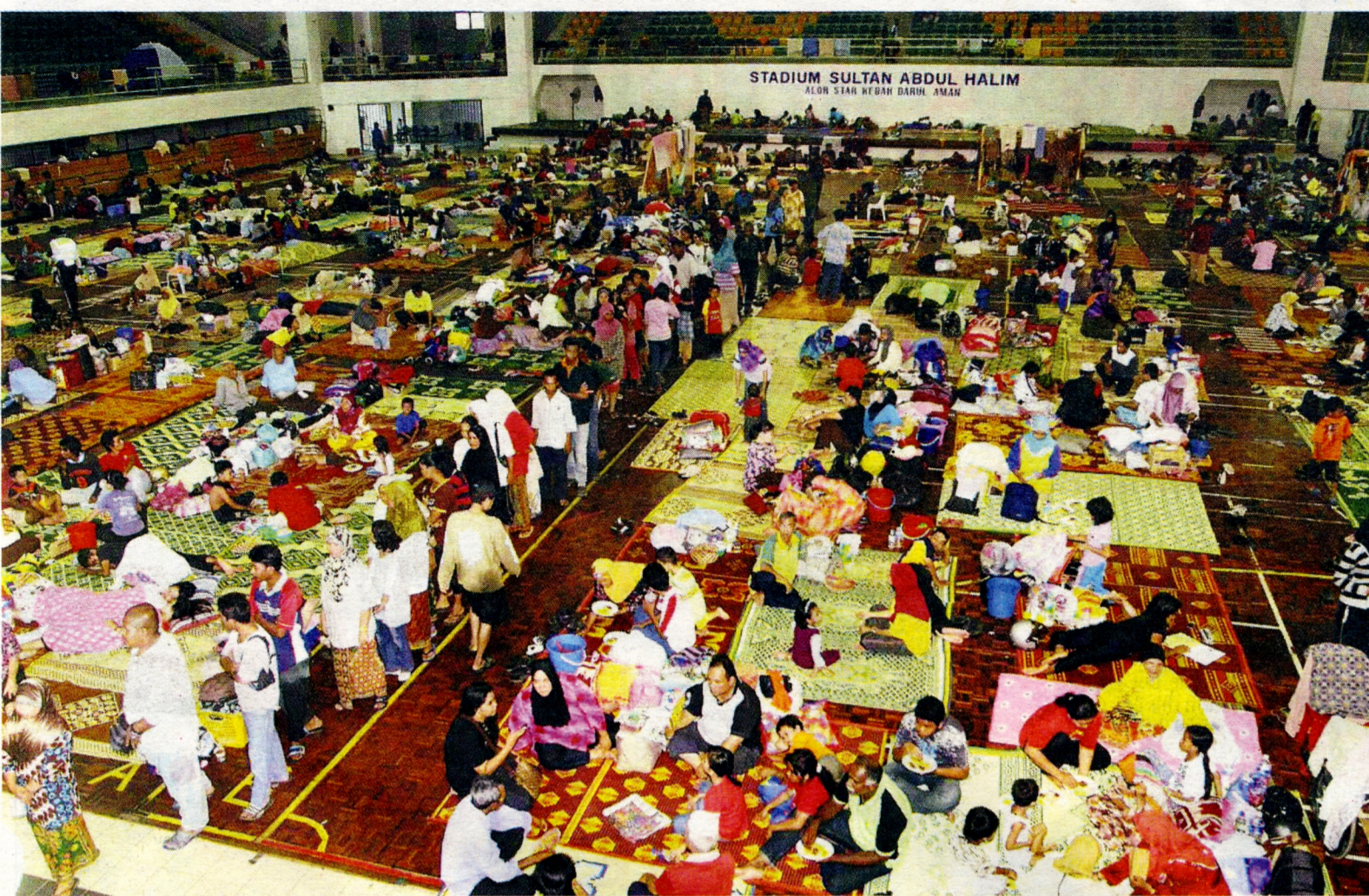
Crowded house: Flood victims making do with what they have at a relief centre in Jalan Suka Menanti in Alor Setar yesterday.

A spokesman at Binjai police station confirmed the incident. — Bernama