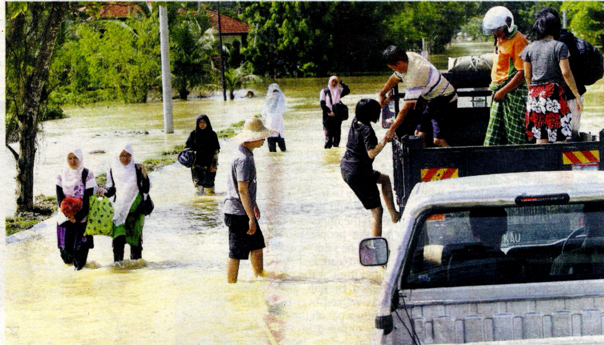
Rescue lorry: Sungai Baru residents hitching a ride on a lorry to get to dry ground yesterday.

The royal couple spent about 45 minutes with the victims.