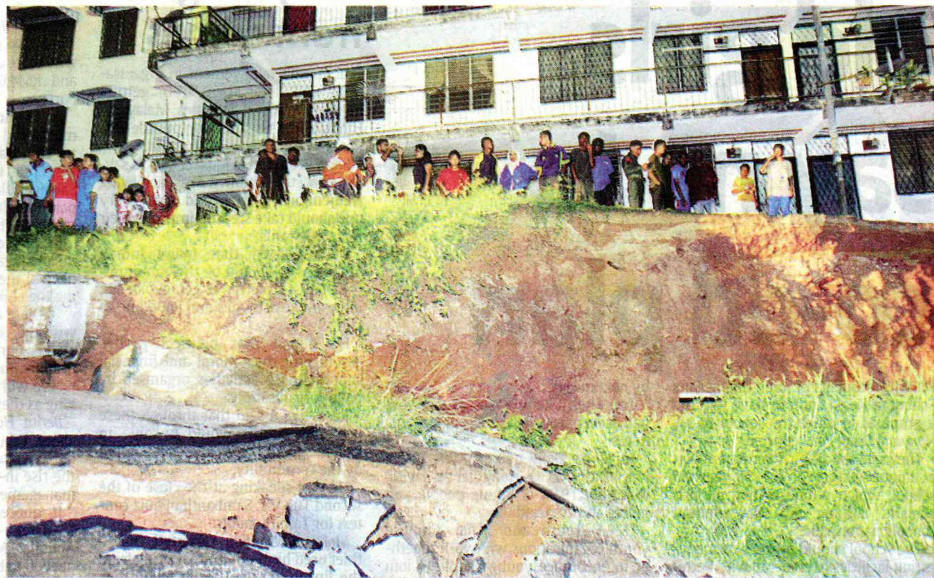
DANGER: Residents looking at the earth that slipped at least 50m near their flats in Section 10 Wangsa Maju, Kuala Lumpur, yesterday evening.