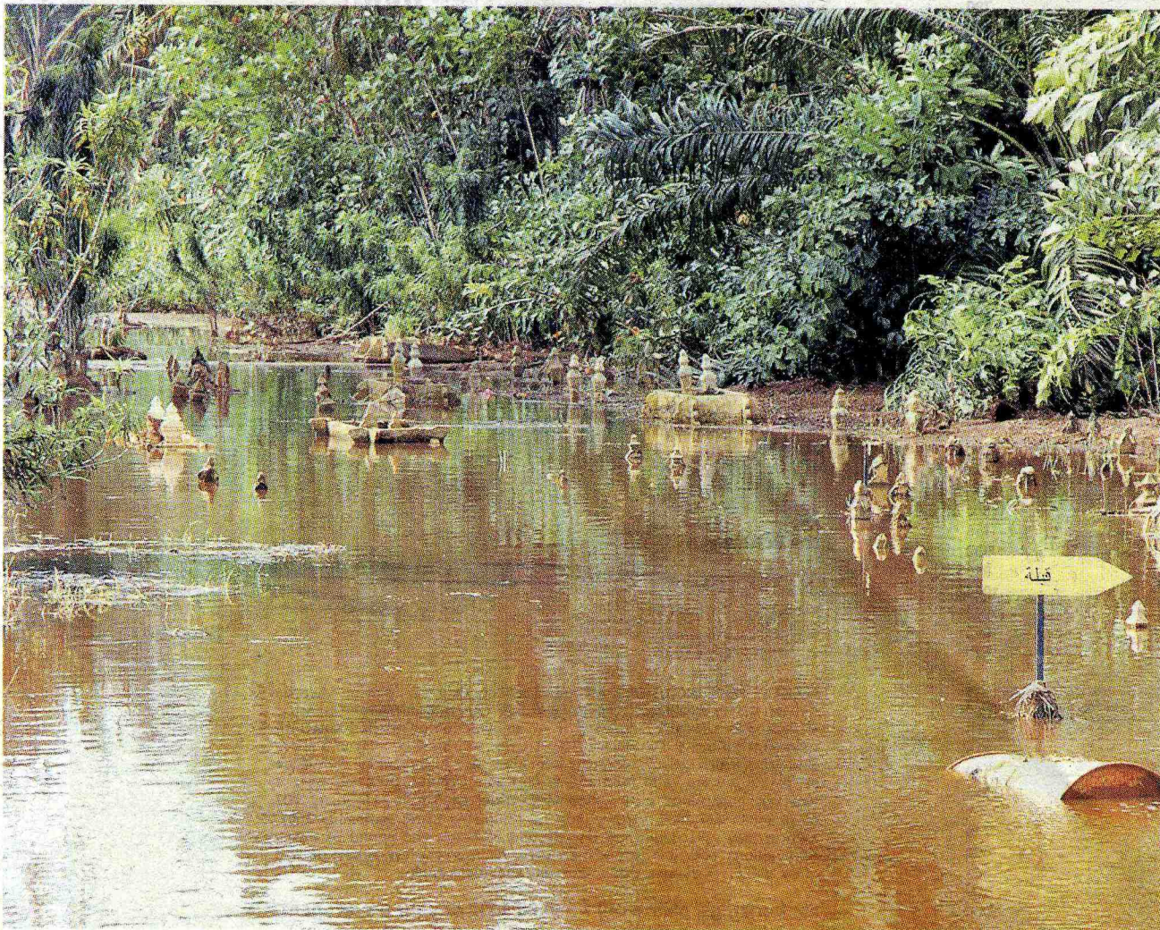
The Parit Karjo Muslim cemetery in Batu Pahat is still inundated by flood waters.

He said he will present a complete list of damage caused by the two Johor floods to the National Disaster Relief Committee chaired by Deputy Prime Minister Datuk Seri Najib Razak.