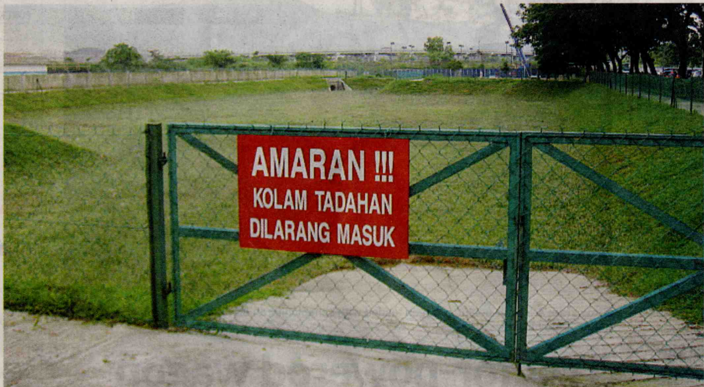
Flood mitigation effort: One of the newly built retention ponds in Taman TTDI Jaya.

“We have created new retention ponds and the embankments on either side of the river have been raised by about a metre,” he said. “And, a new automated pump house is being built while the river is being widened and deepened.”