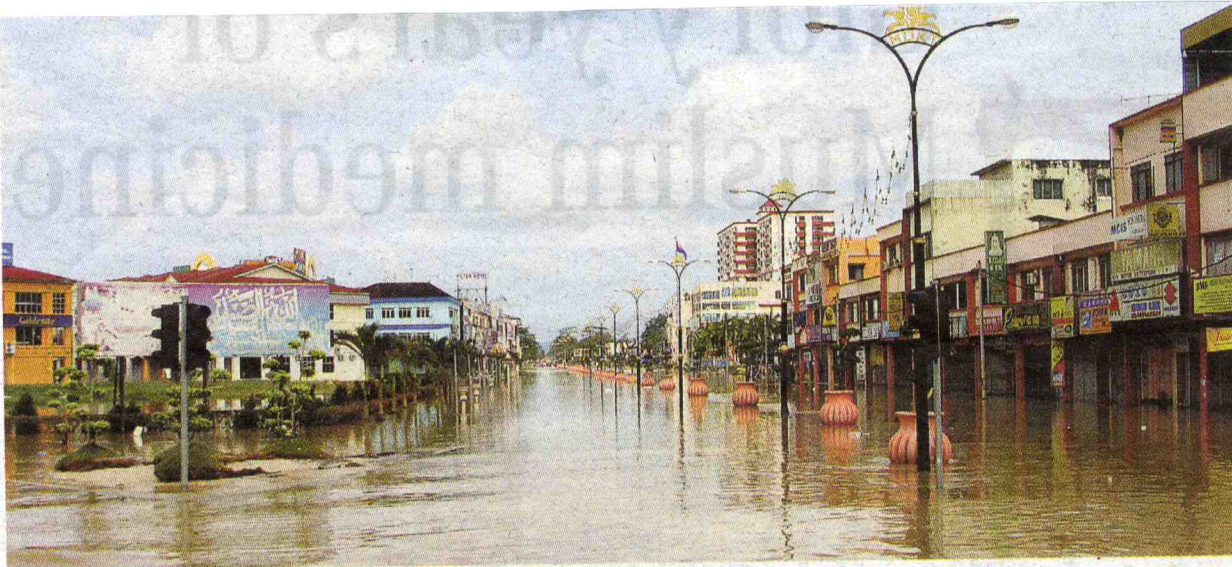
The situation in Kota Tinggi town has not changed for a week.