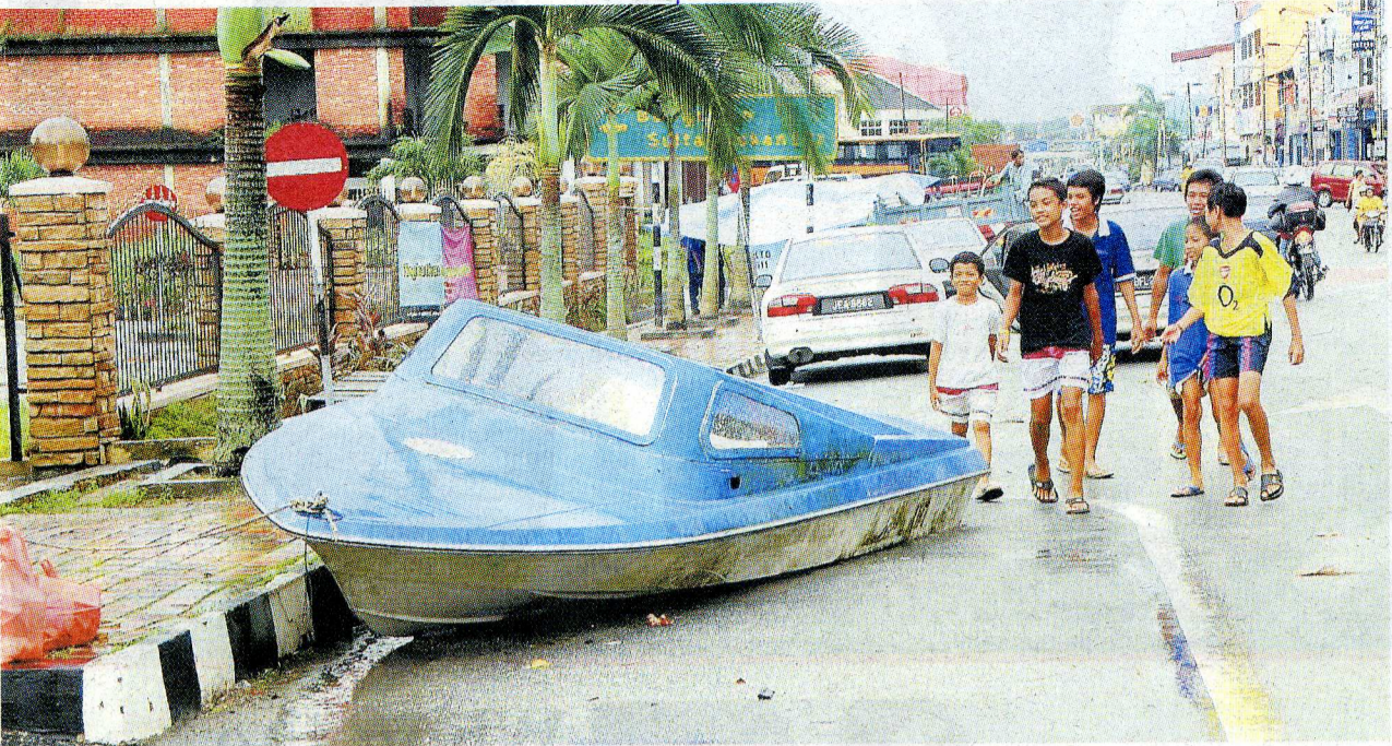
A motor boat stranded on Jalan Tun Habab, Kota Tinggi, after flood waters receded.