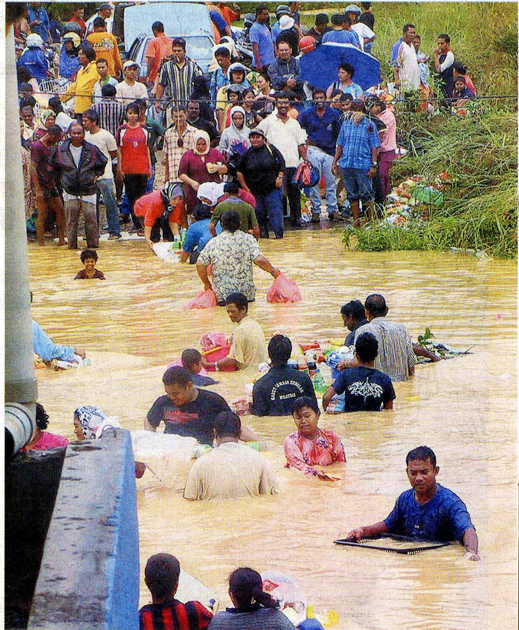
People searching for goods swept out by flood waters in Johor Baru yesterday.

All 455 victims from the village have been evacuated and have taken shelter at Keratong Felda scheme. The gushing water had