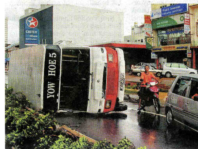
A bus lands on its side in Jalan Sri Genuang, Segamat.