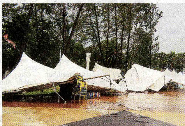
Canopies put up for the opening ceremony of the Anugerah Bintang-Bintang Popular 2006 were destroyed by floodwaters in Kuala Terengganu yesterday.