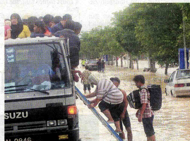
Help is at hand for stranded victims in Malacca.