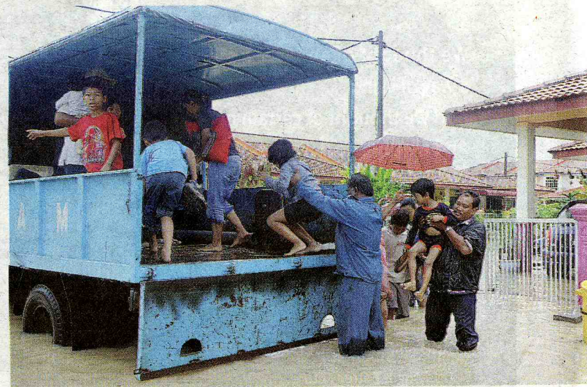
Workers from the Malacca Water Company helping victims to evacuate.