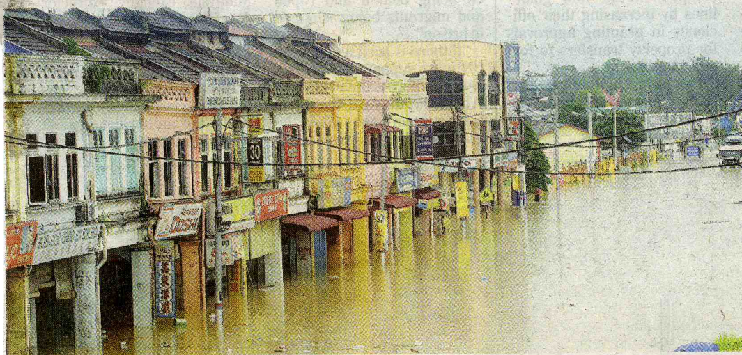
Gemas town centre in 1.5m of water.