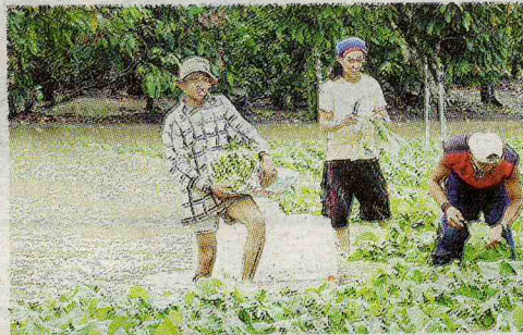
Several lucky farmers in Muar are not so badly affected by the floods.