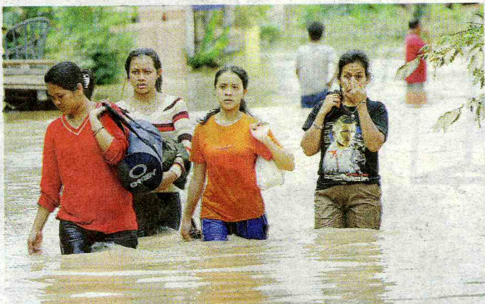
Women in Kampung Kangkar Tebrau, Johor, wading through flood waters to get to their destination.