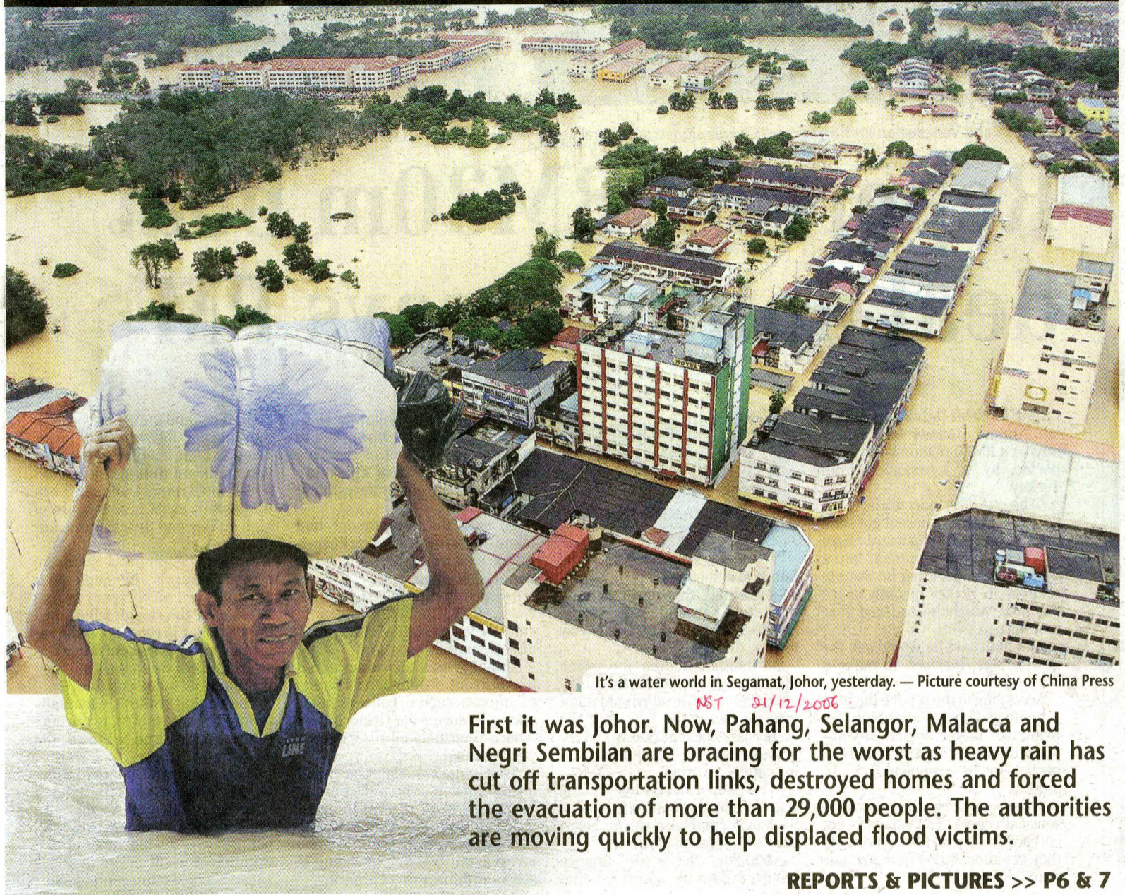
It's a water world in Segamat, Johor, yesterday.