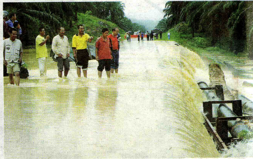
The road from Segamat highway leading to Felda Selancar is impassable.